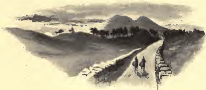
Between Trawsfynydd and Maentwrog.